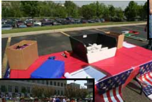
Tic Tac Toe