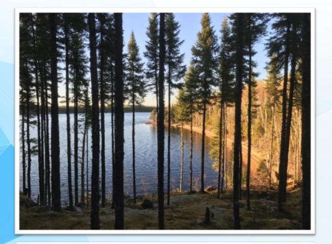
If you're looking, you'll be able to find me in my next office—either my shop or the remote Canadian woods . . . pretty far from most regulations.