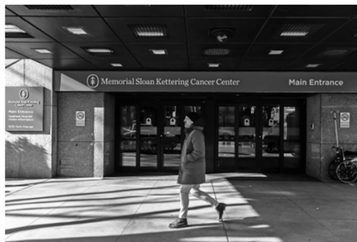
Memorial Sloan Kettering Cancer Center in Manhattan. The center announced an overhaul of its policies on Thursday after an outside review found that top officials repeatedly violated conflict-of-interest rules.