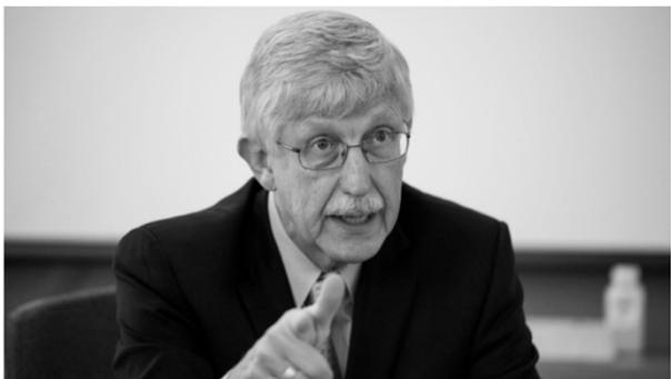
Francis Collins, the director of the National Institutes of Health